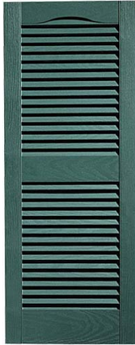
Traditional Louvered Shutters