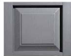
Square Transom Design